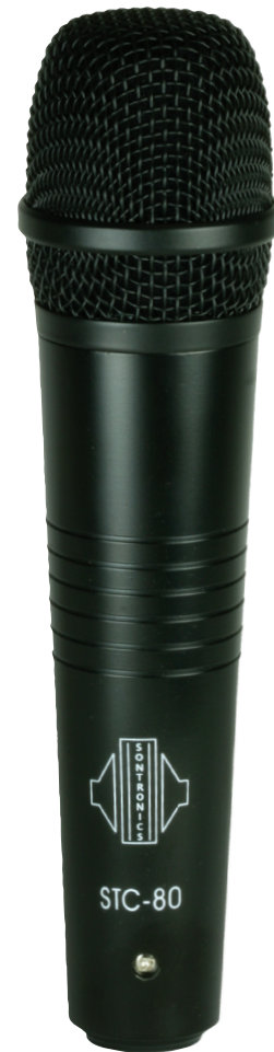
Frequency Chart: STC-80

The STC-80 is Sontronics' first handheld dynamic microphone. It boasts the same rugged construction as Sontronics' handheld condensers and offers a high-quality dynamic capsule. The STC-80 has a solid feel with superb sound quality and low handling noise. It delivers first-class results on stage and in the studio. While ideal for vocals and speech, the STC-80 also performs well as a direct microphone for guitar cabinets, snare drums, and toms. Its internal pop filter effectively reduces plosive sounds. The STC-80 is packaged in an aluminum flight case for ultimate protection on the road.